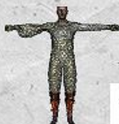
Yoroishita = Under Armor