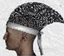
Eboshi (proper n.)

= Ebira (proper n.) Quiver Bundle of Arrows