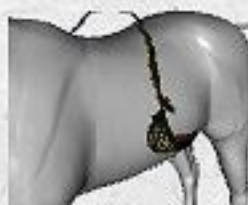
Abumi L / R = Stirrup