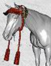
Omogai = Headstall