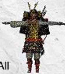
! Yoroi All

This is the armor called O-yoroi which Leader of the samurai wore in feudal Japan.