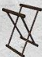
Tsukue Mokubu =Desk Wooden part