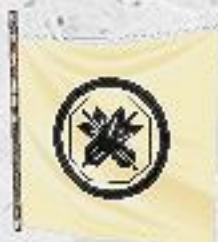
Manmaku 1 = (p.n.) Curtain