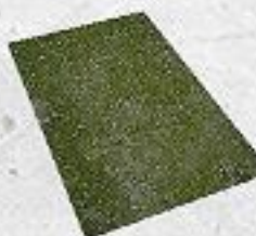
Gungi Shikichi = Gungi Site