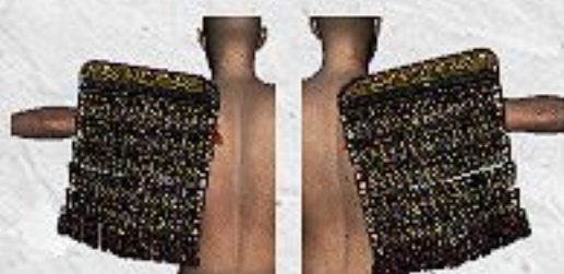
Oosode L / R

(This plate is consisting of leather and iron slats, due to be able to bend and stretch when pulling bow or wielding sword)