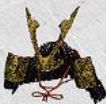
Kabuto (proper n.)

= Japanese Signal Arrow (Type of arrow used by samurai class of feudal Japan)