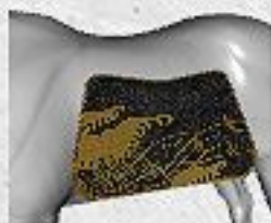
Aoriita = (p.n.) Leather Mudguard