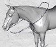
Tazuna = Reins