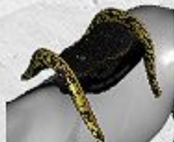
Kura = Saddle

Horseback and Both sides' protection which put under the saddle