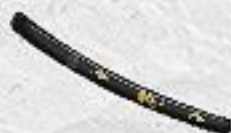
Shoutou = Knife

= Big Sleeve L / R ( Protective parts from upper arm to shoulder)