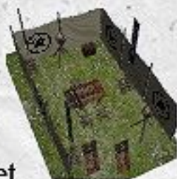
Gungi Set = Council of War ( Wearable Preset )