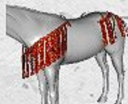
Munegai = Breastplate