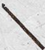
Tate Shijibou (=slide bar)