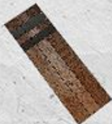
Tate = Shield