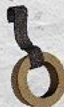
Yobi Yunzuru = Spare Bowstring