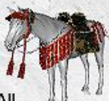
! Bagu All