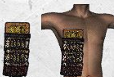
Sendan Ita = Sendan (p.n.) Plate

= Kyuubi (proper n.) Plate (This plate which's near to heart has many examples of the board of iron)