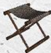
Shougi =(p.n.) Folding stool