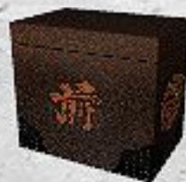
Yoroi Bitsu = Armor case