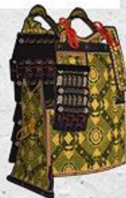
Tsurubashiri = Cuirass